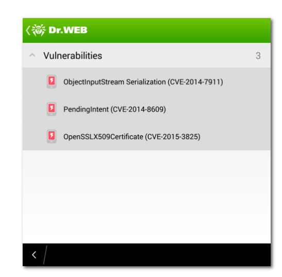
Figure 9. List of security problems detected on the device

To view the detailed information on any detected problem and to resolve it, open one of the categories and tap a problem in the list.